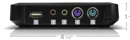
SIDE OF L230